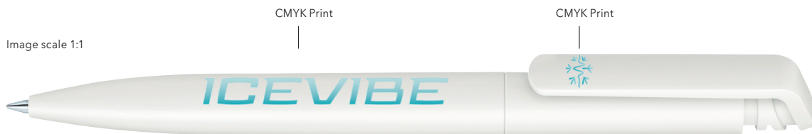
Image scale 1:1