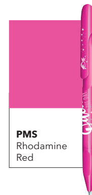
PMS Rhodamine Red