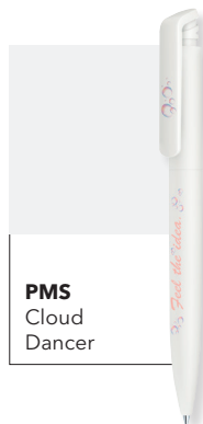
PMS Cloud Dancer