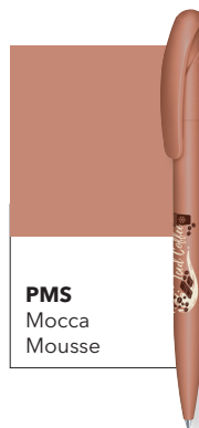
PMS Mocca Mousse